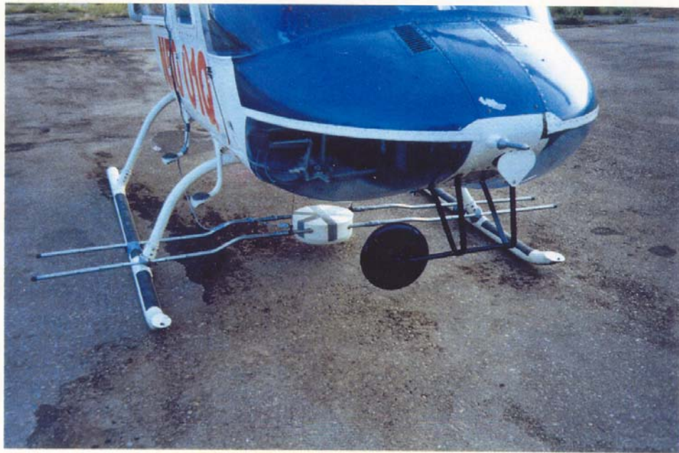
(A.S.D.S.-101) AERIAL SURVEY DETECTION SYSTEM ATTACHED TO HELICOPTER SKIDS. SHOWS THE TRANSMITTER/RECEIVER MODULE. ELECTRONICS AND RECORDING INSTRUMENTS ARE LOCATED IN THE HELICOPTER CABIN.