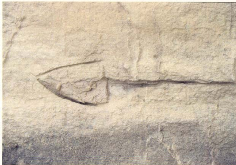
DIRECTION MARKER. ARROW CARVED IN ROCK SHOWING DIRECTION TO GO.