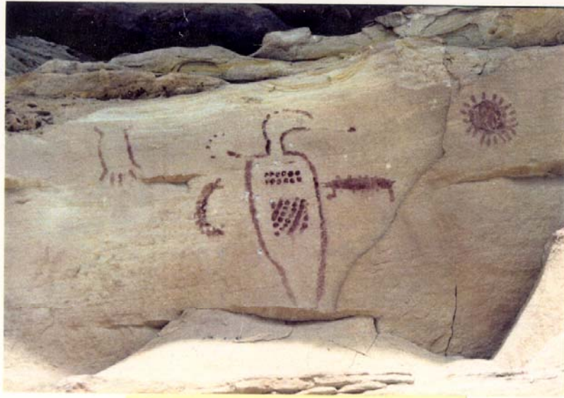
PICTOGRAPH INDICATING THE DIRECTION TO TREASURE TROVE.