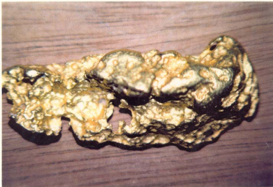
GOLD NUGGET. RECENTLY RECOVERED. WEIGHS ALMOST THREE (3) OZS.