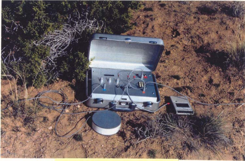
(AGI-501) ADVANCED GEOPHYSICAL INSTRUMENTATION. SURFACE SURVEY EQUIPMENT.